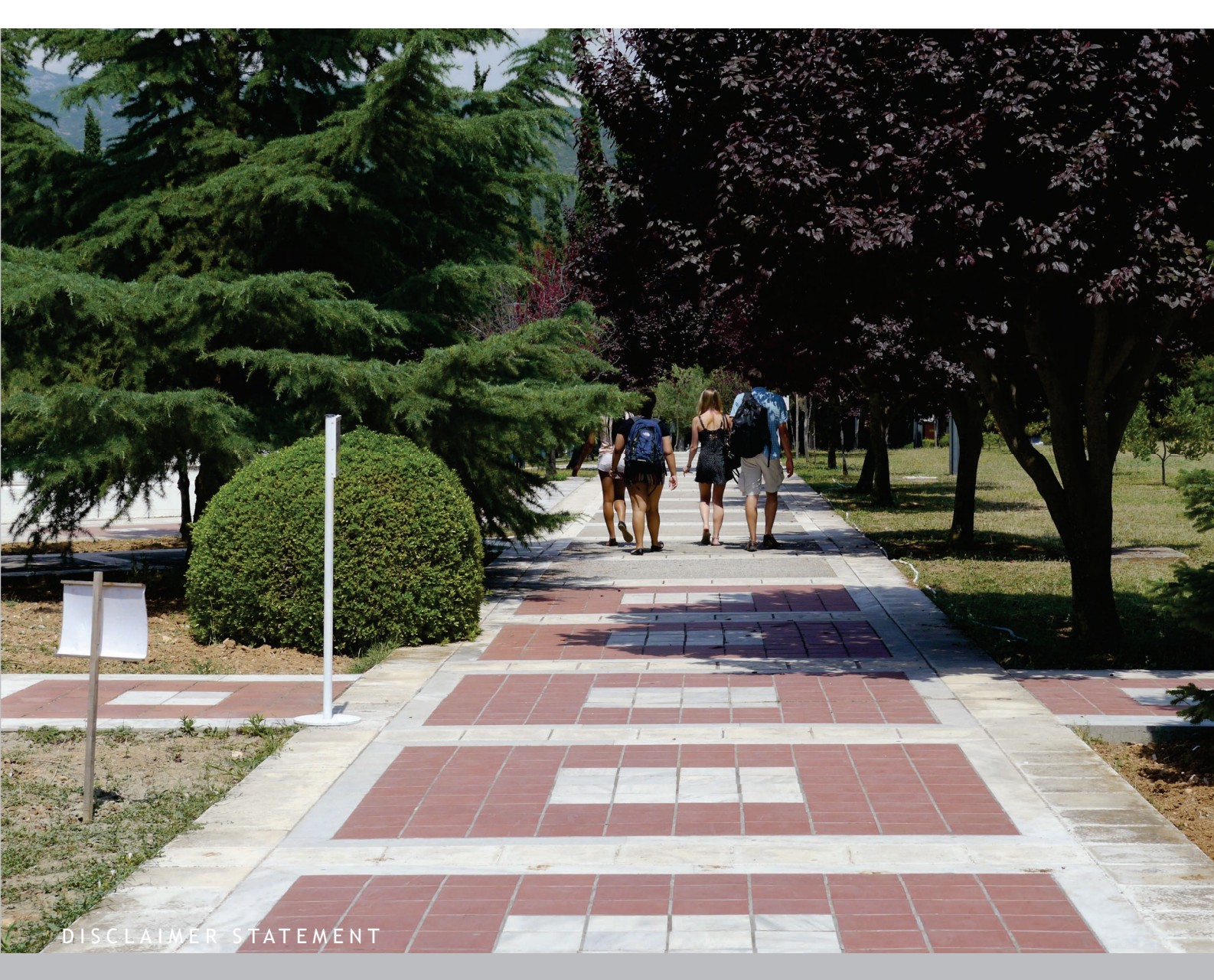
The American College of Thessaloniki has no political, governmental or religious affiliation. ACT values a diverse college community. ACT does not discriminate on the basis of race, color, national or ethnic origin, religion, sex, sexual orientation, marital or parental status, age, or disability in the recruitment and admission of its students, in the administration of its educational policies and programs, or in the recruitment and employment of its faculty and staff.